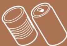
food tins & cans