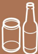
mixed glass bottles & jars

Do not put them in plastic bags, and do not crush or squash them completely flat as this makes sorting them difficult.